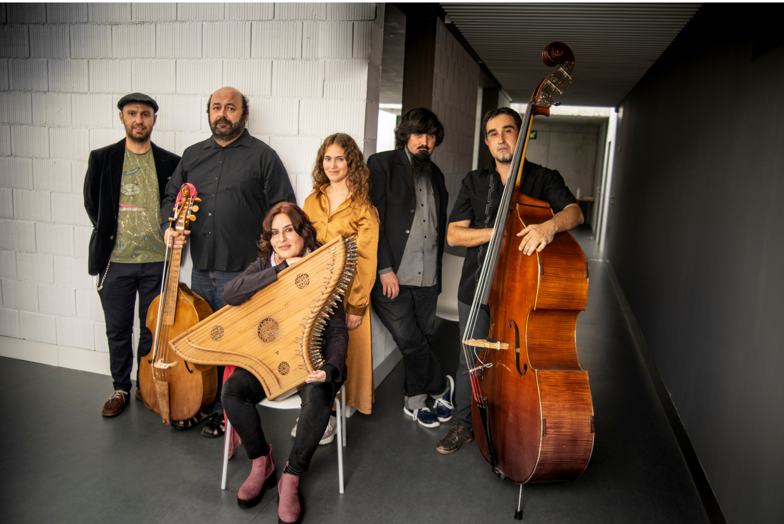
Ben Vennas Maio band.

Freedom and ornamentation are two pillars of Ben Vennas Maio. Voices and instruments offer a trip through nine tracks by Alfonso X and others from the Arab-Andalusian tradition, renewed and arranged for this release. These cantigas are based on rich rhythmical patterns giving another dimension to the style of jazz. Texts of these cantigas are sometime surprising, for instance "Non ven al maio", a song is a critic about the excesses of the wealthy.